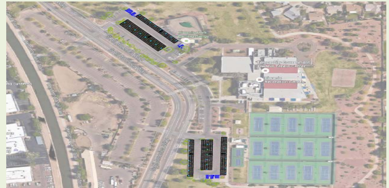
372 kW Kiwanis Recreation Center – Shade canopies