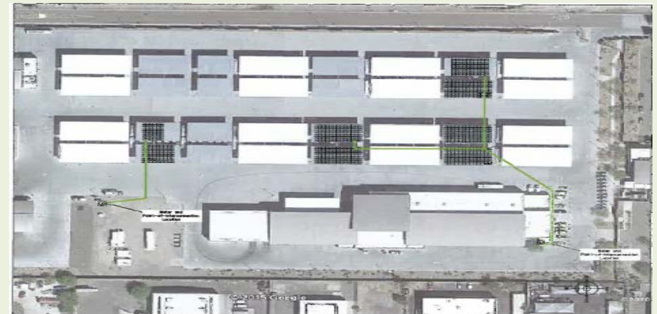
960 kW East Valley Bus & Operations Maintenance Facility