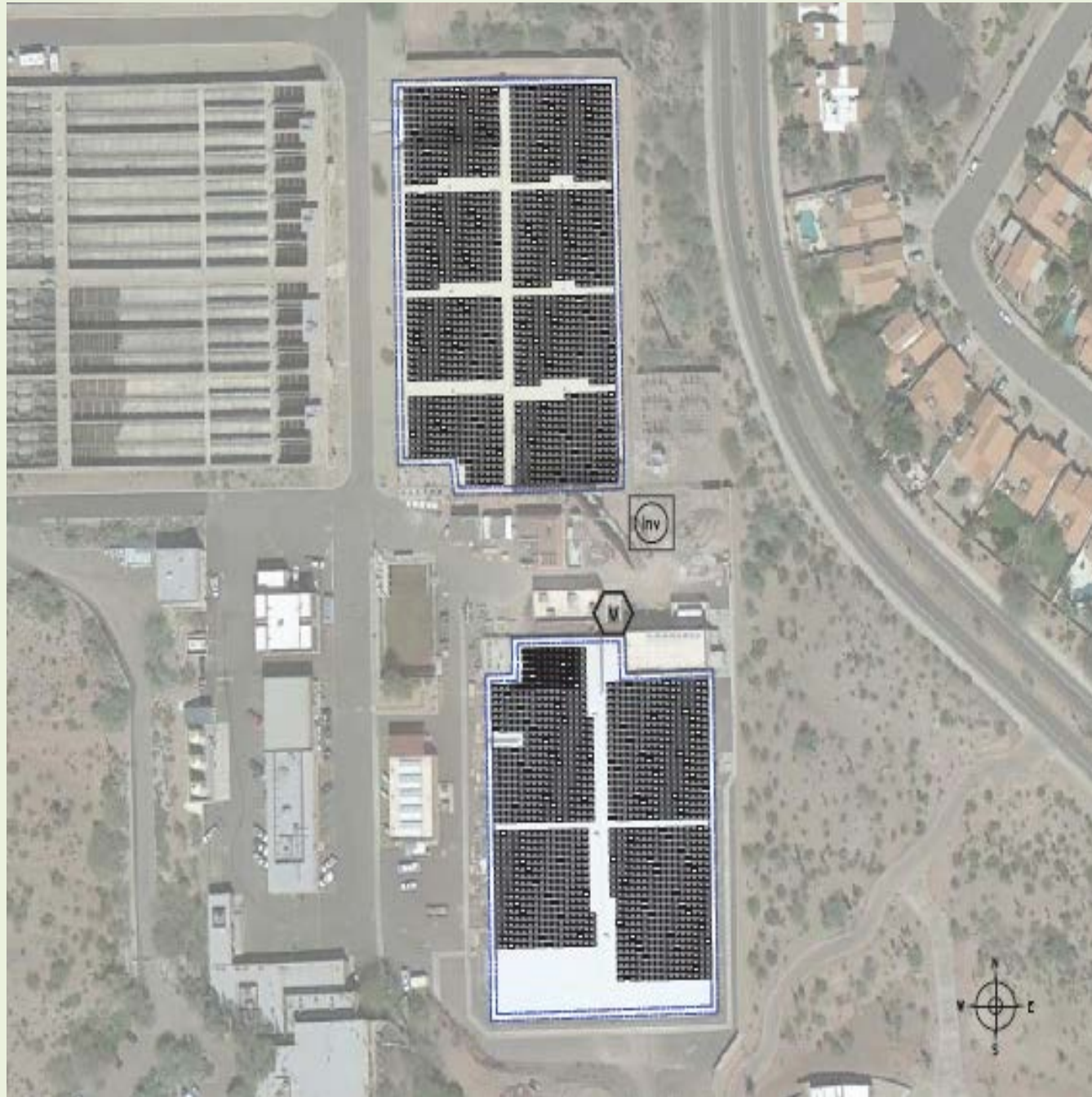
950 kW system - Johnny G Martinez Water Treatment Plant – 25% of power needs